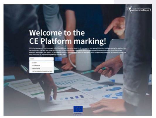
Home page of the application

The CE mark must be affixed to all new products covered by at least one European New Approach Directive, produced in the European Union or third countries, used products imported from third countries, and products already on the Single market that have been significantly modified to be considered as new products.